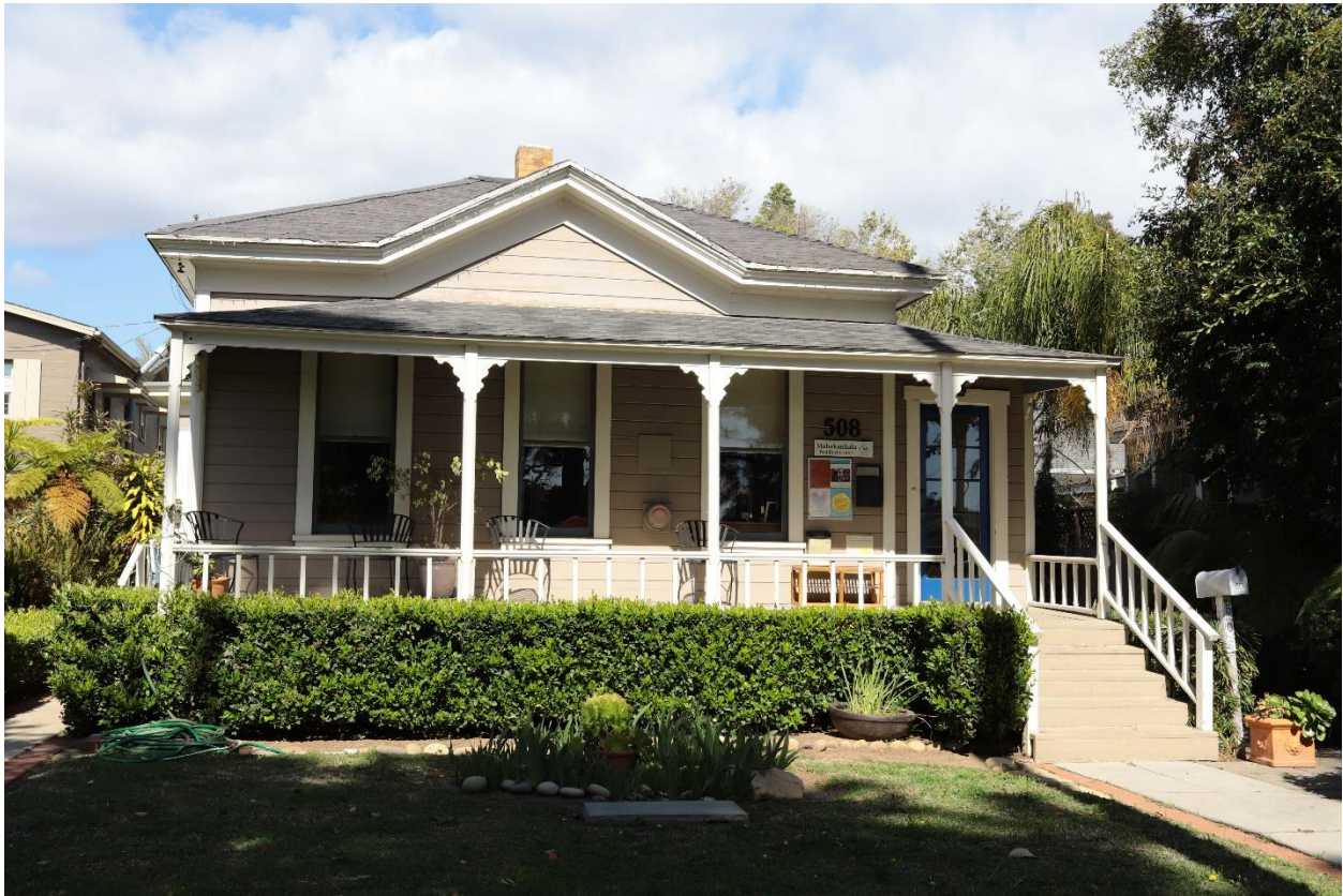
Figure 1 506 Brinkerhoff Avenue from: Herics, Sebastian, 25 March 2021.

Designation Status: Structure of Merit. Brinkerhoff Avenue Historic District contributor.