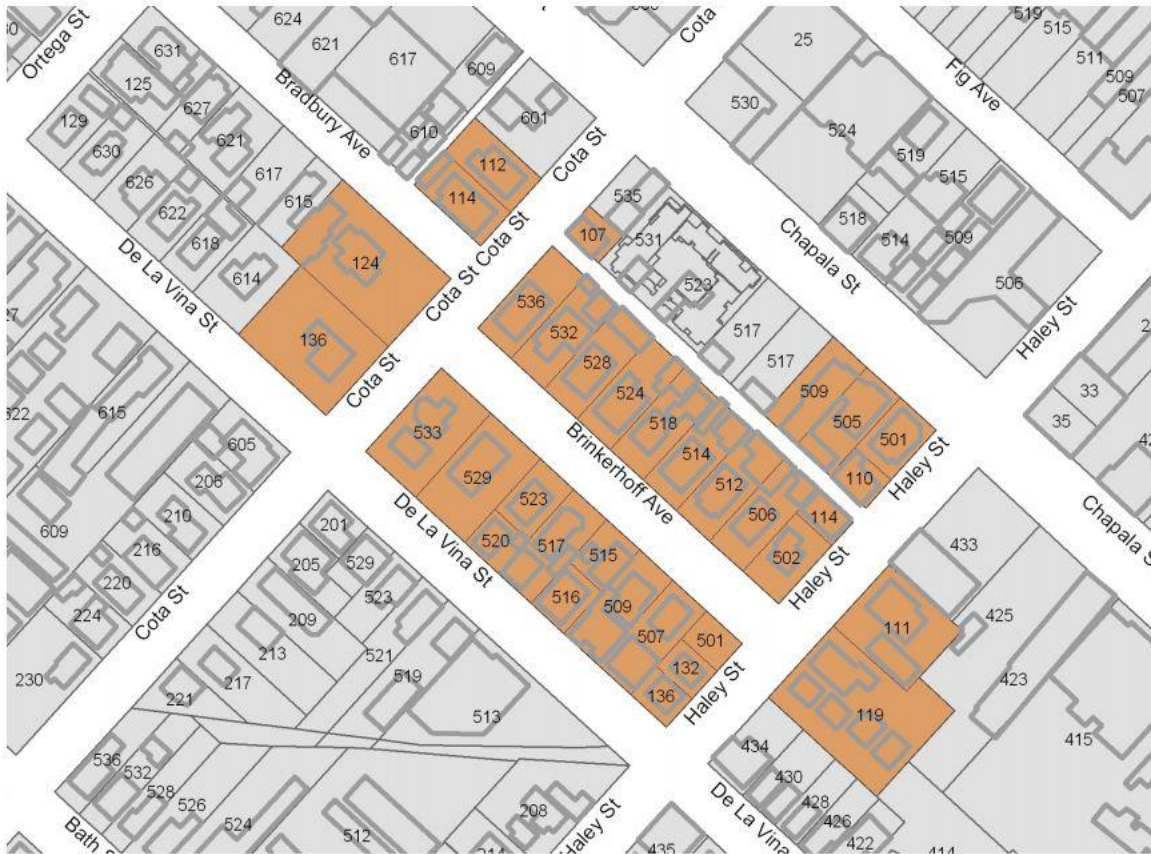
Figure 5 The Brinkerhoff Avenue Historic District

506 Brinkerhoff Avenue is historic because it embodies the Folk Victorian architectural style, making it a significant part of the heritage of Santa Barbara in the Brinkerhoff Avenue Historic District.