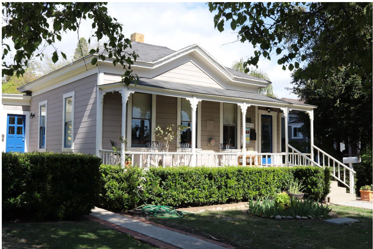
Figure 2 506 Brinkerhoff Avenue from the side

As American Colonial Revival and Spanish Colonial Revival styles looked to the past for inspiration, so too the Folk Victorian looked to its roots, which were the simple, National Folk structures, to base its forms. These forms were then built upon with moldings and pre-cut details available from more current Victorian styles. Sometimes, older folk houses were simply updated with newer elements, including whole porches (Grumbine).