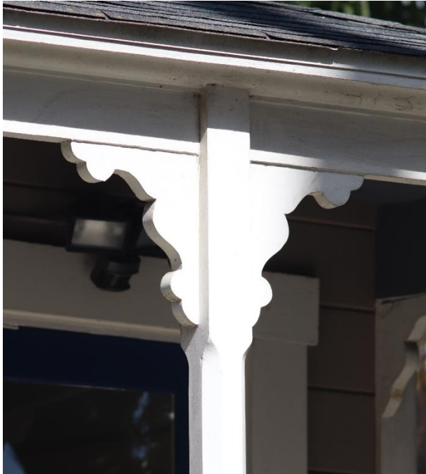
Figure 3 The decorative brackets that indicate a Victorian taste from: Herics, Sebastian, 25 March 2021.

new production techniques in the 1800s, builders had access to lumbered and machine-cut wood for construction (McAlester, 144). Specifically, pre-cut detailing—like brackets and spindework—could be bought and simply added to the home to the taste of the owner (McAlester, 398). So 506 Brinkerhoff has massing that is nearly 400 years old, but with the fashionable architectural tastes of the nineteenth century, made possible by the technological development of the railroad and wood working machinery.