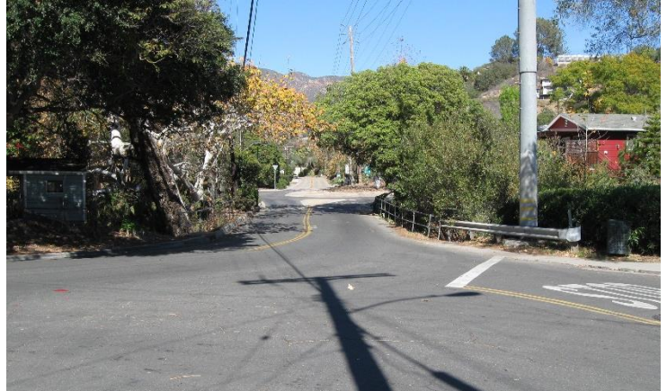
Montecito-Yanonali Street Bridge facing north

The Project will replace the existing bridge with a new structure to ease pedestrian and bicyclist traffic through the busy Montecito-Yanonali Streets intersection. The Project also includes the construction of a sidewalk on the north facing side of Salinas Street from Mason Street to Clifton Street.