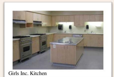
Girls Inc. Kitchen

• Girls Incorporated of Santa Barbara, which last year served 202 unduplicated girls, has had numerous facility improvements. Two girls served by Girls Incorporated, ages 6 & 11, are being raised alone by their mothers because their fathers are gone. Their mothers work full time, and earn low wages. Girls Inc. provides a wide variety of enriching activities like leadership, sports and arts and the girls are excelling. In Fiscal Year 2012-13, with a CDBG grant Girls Inc. completely replaced 65 outdated and inoperable windows of the program center on Ortega Street where these girls attend. The year before, the center's kitchen was completely rehabilitated.