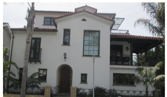
A Spanish Colonial Revival Residence constructed in 1928 that was one of the properties found to be individually significant in East Beach area through the Waterfront Survey.