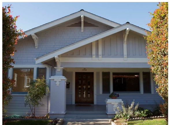
This Craftsman bungalow was identified as a contributing structure to a potential Bungalow Haven Historic District through phase 1 of the Lower Riviera Survey.

The Lower Riviera Historic Context Survey covers the area located at the base of the ridge separating Mission and Sycamore Canyons, known as the “Riviera”. Covering 309 acres, the survey is defined on the north by Alameda Padre Serra, on the south by Laguna Street and North Milpas Street, on the west by Mission Park and Los Olivos Street, and on the east by Easy Canon Perdido Street. The survey was conducted in 2011 by Post/Hazeltine and Associates, and was done so with close attention paid to the Secretary of the Interior’s Standards for Identification . The survey was completed in five stages, the first of which found an area known as Bungalow Haven, which is currently in on the Santa Barbara Potential Historic Resources List as a Historic District. Phase two concluded that two congruent yet distinct districts are located near Santa Barbara Mission on Plaza Rubio and Plaza Bonita. The remaining phases found no potential historic districts, but certainly found numerous individually significant structures, built between 1900- 1940 during a time of large scale development in an attempt to create an American equivalent to the French Riviera.