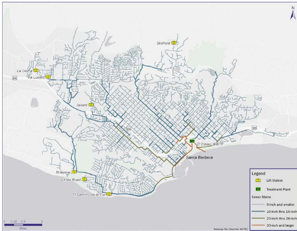
Figure I-2. City of Santa Barbara Wastewater Collection System Lift Stations and Force Mains