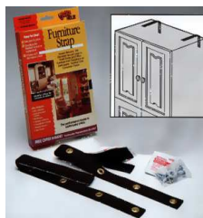
Furniture Strapping Kits