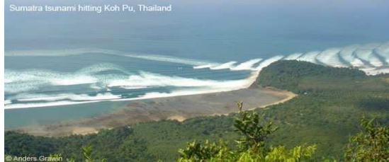
2004 Sumatra tsunami hitting Koh Pu, Thailand

On December 12, 1812 a tsunami struck the Santa Barbara and Ventura coastline shortly after a large earthquake. Though reports of the size of this tsunami has been debated, the event was large enough to inundate low-land areas and cause damage to nearby ships