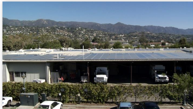
CITY CORPORATE YARD SOLAR PANELS

For private development, the City encourages the use of photovoltaic arrays on new construction, redevelopment, and significant remodel projects, if physically feasible. Furthermore, the City has integrated environmentally sustainable goals in the management and operation of all City Departments. Examples of renewable energy sources employed in City operations include photovoltaic generation facilities in the Public Works Corporate Yard, solar thermal systems used to heat water at the Harbor restrooms, and a cogeneration system at the El Estero Wastewater Treatment Plant that converts fats, oils, and grease from local restaurants into renewable energy to power the plant. In 2017, 30 percent of electrical power that powers City facilities is defined as renewable, and the City adopted a goal of 100 percent renewable energy use by municipal facilities and the community by 2030.