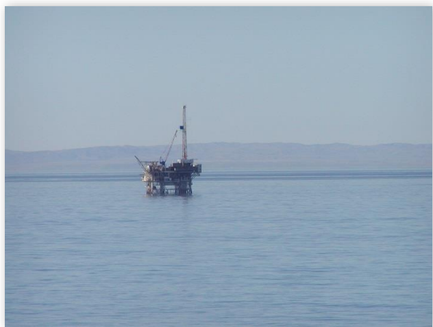
DISTANT OIL PLATFORM

There are no existing on or offshore oil and gas processing or producing facilities, pipelines for transporting crude oil, refineries, petrochemical facilities, or thermal electric generating plants within City boundaries and, based on existing land use designations and zoning, no large energy facilities could be developed within the Coastal Zone. However,