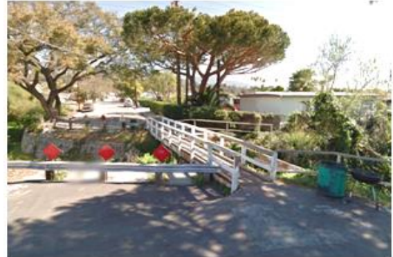
Cacique Street Pedestrian Bridge Before Construction

This project was almost 100 percent funded with a competitive Active Transportation Grant awarded to the City of Santa Barbara by the State of California. Our community has been awarded the most money of the Active Transportation Grant Program per capita of any other City in the State.