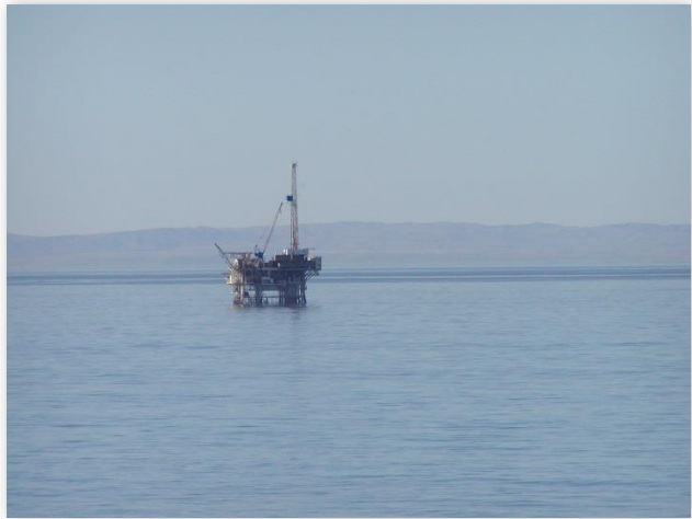
DISTANT OIL PLATFORM

There are no existing on or offshore oil and gas processing or producing facilities, pipelines for transporting crude oil, refineries, petrochemical facilities, or thermal electric generating plants within City boundaries and, based on existing land use designations and zoning, no large energy facilities could be developed within the Coastal Zone. However,