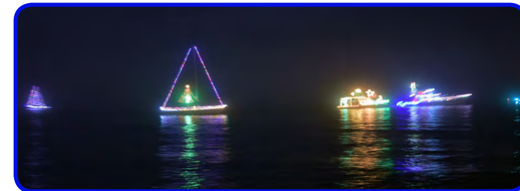
Wild West Holiday-themed vessels lit up the Waterfront at Parade of Lights

This year's event was sponsored by the 2016 Parade of Lights Committee, City of Santa Barbara Waterfront Department, Santa Barbara Harbor Merchants Association, Stearns Wharf Business Association and Santa Barbara Yacht Club. Considering the fun of this event and the rich prize packages, it's not too early to circle your calendar for next year's Parade of Lights on Sunday, December 10, 2017.