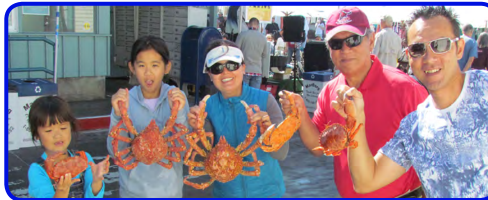
A family enjoys fresh seafood at the 2016 Harbor & Seafood Festival

Missed the Festival? Loved it? Heard about it from friends? Well, it's never too early to mark your calendar for next year's event on Saturday, October 14, 2017.