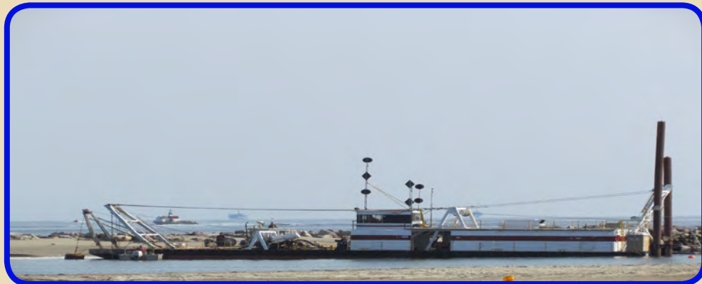
The "new" dredge at the start of the fall dredging cycle December 14, 2016

The federal government annually appropriates about $2.7 million for Santa Barbara Harbor dredging. There is no cost to the City other than a few weeks of disruption on East Beach and West Beach to accommodate the dredging. The City owes a debt of gratitude to the Corps for its commitment to the continued dredging of our harbor.