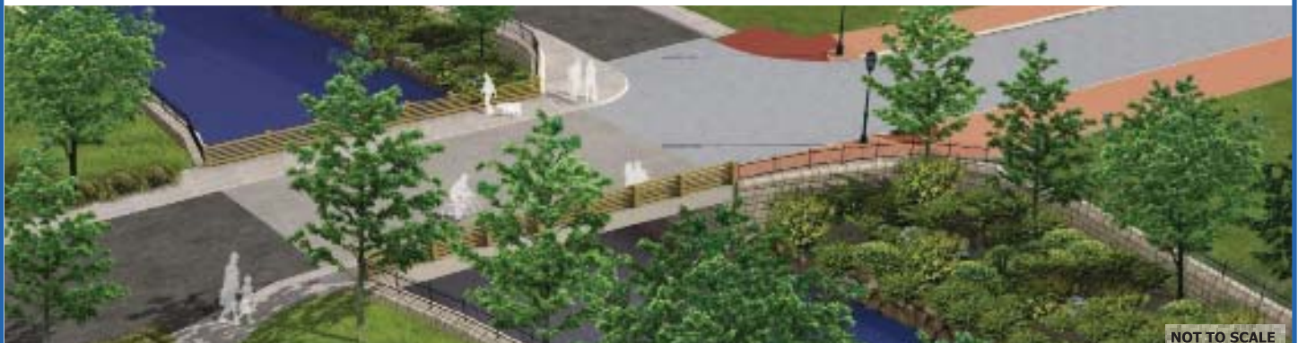
RENDERING OF MASON ST. BRIDGE