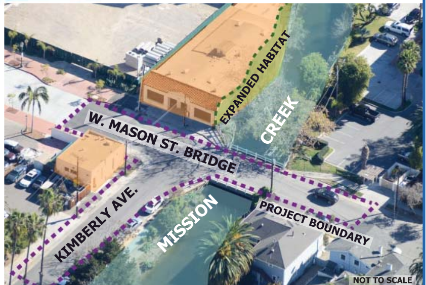
MASON STREET BRIDGE OVER MISSION CREEK BETWEEN STATE ST. & CHAPALA ST.