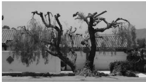
Topped California Pepper Tree

Other modes of view restoration are crown reduction pruning or even tree removal . Crown reduction can reduce the overall height of the tree with appropriate thinning cuts. Crown reduction is not the same as topping.