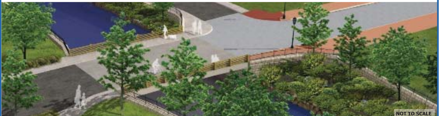
RENDERING OF MASON ST. BRIDGE