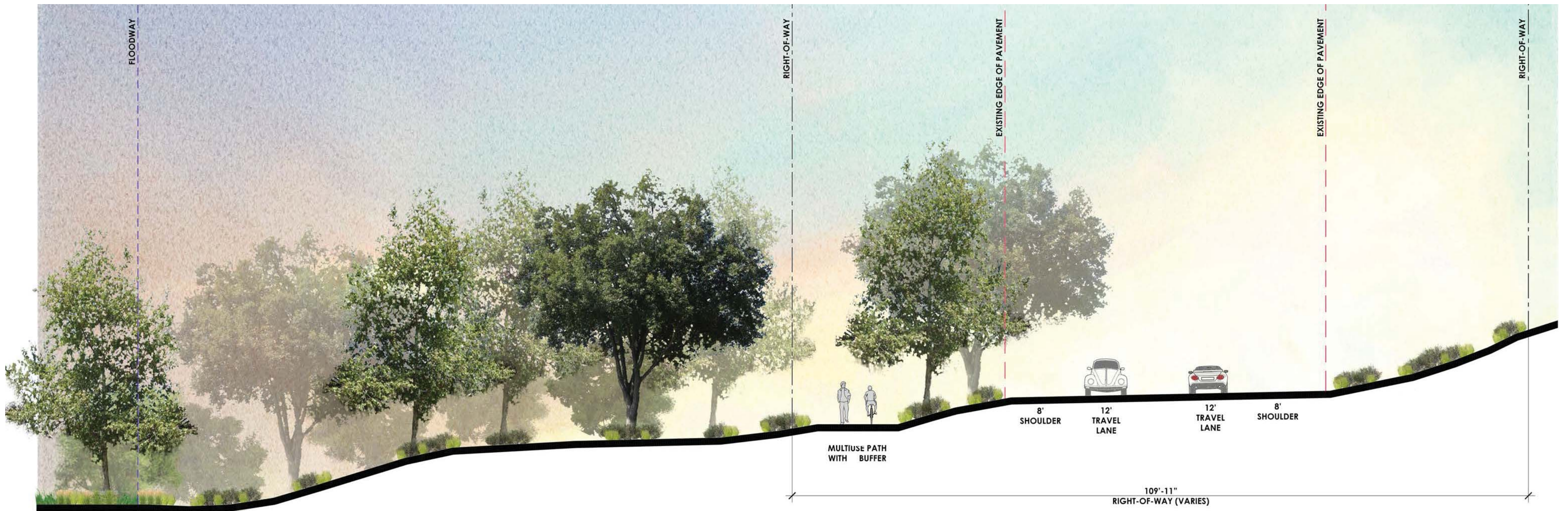
F Section at Las Positas Road where Trail North of Proposed Cliff Roundabout