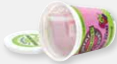
EMPTY PLASTIC CUPS