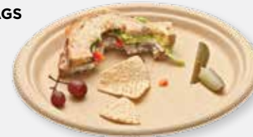
COMPOSTABLE DISHES & LEFTOVERS