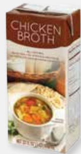
SHELF STABLE CONTAINERS