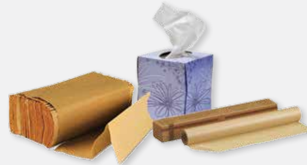
SOILED PAPER & TISSUES