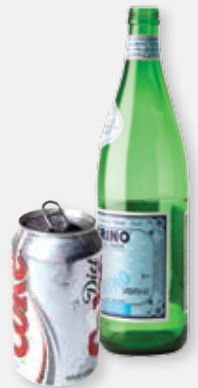
EMPTY CANS & GLASS BOTTLES