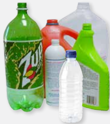
CLEAN, EMPTY PLASTIC BOTTLES