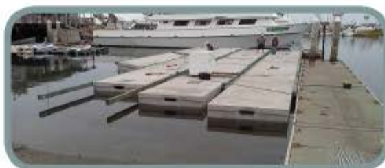
Santa Barbara City

First, "K" finger will be replaced, with existing docks demolished the first week in January. New docks show up the following week and should take about five weeks to install. After that, the same cycle begins for "J" finger. All work should conclude by April. Similar to the last four phases, all installations include new docks, utilities, dock boxes, and power centers.