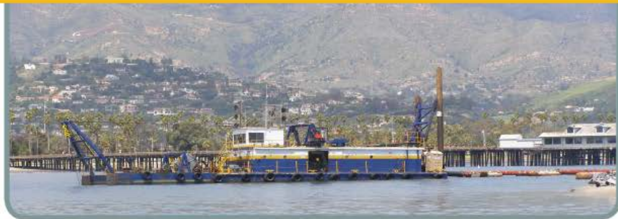
Santa Barbara City

Mark Your Calendar Event and Harbor Commission schedules