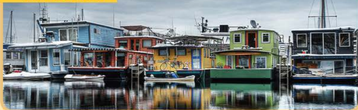
Houseboats in Seattle Harbor