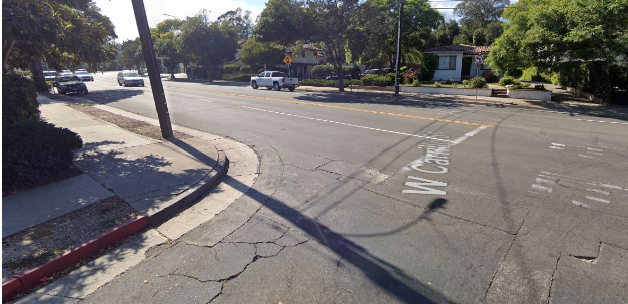
Phase 1B Project Location – Intersection of Carrillo Street and San Pascual Street.