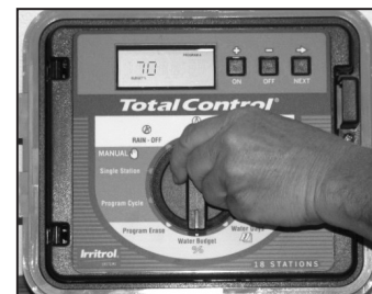
Learn how to schedule your timer at our webinar.

Join us on Thursday, March 4 at noon for a lunch & learn webinar to learn tips and tricks to set and maintain your sprinkler timer programs – take control of your controller! Register in advance via Zoom at SantaBarbaraCA.gov/GardenClasses .