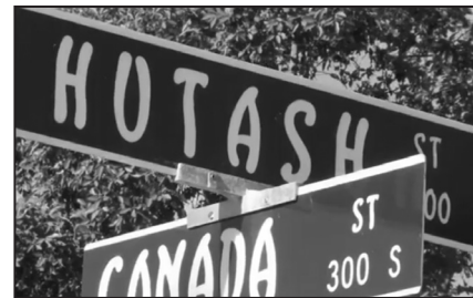
In December, Indio Muerto Street was renamed Hutash Street during a virtual renaming ceremony.

In spring of this year, the Barbareño Chumash Tribal Council requested that the City rename Indio Muerto Street, Spanish for "Dead Indian" to Hutash Street, a Chumash term for "Earth Mother." The City has a well-established history of its original street names. However, the City Council determined that the street name was not appropriate