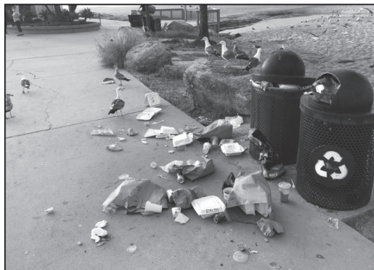
Dispose of trash in a proper manner to help keep beaches clean.

As we gear up for socially distanced summer beach visits, we need to be mindful that litter on the beach ends up in the ocean. If a container is full, please place it in a nearby container or bring it home with you. Overfilling containers or placing trash around the containers scatters litter around our beautiful beaches. There are over 200 public containers installed at the waterfront as determined by normal and seasonal generation of trash at these locations. Public containers are there to support the cleanliness of these areas, but as always, when we generate trash in a public space it's our responsibility to dispose of that trash in a proper manner whether it be in an available container or at home. We have increased servicing and litter collection at this time, and we are now asking the public to do their part in keeping our beaches clean.