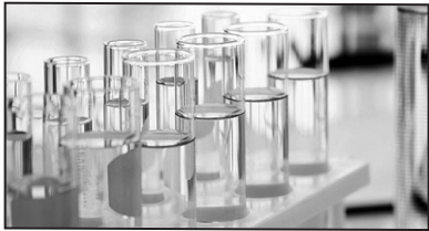
Testing is free and available to anyone.

Free, in-person COVID-19 testing is available from the Santa Barbara County Public Health Department at Earl Warren Showgrounds. Anyone is eligible to be screened, however individuals who meet certain conditions will be prioritized. There is testing capacity for anyone who is interested. To register call (888) 634-1123. For more information visit https://lhi.care/covidtesting .