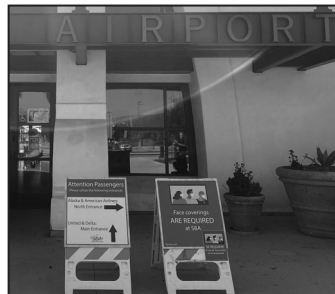
Signage throughout the terminal informs visitors of social distancing protocols and the face covering requirement.

The Santa Barbara Airport has experienced an increased demand for air travel over the past week and expects that growth to continue. The Airport has been working hard to ensure the best and safest experience for passengers' return. This includes the maintenance of the long-term parking lot, which reopened in June. Passengers will also experience additional signage throughout the terminal with the important notes that face coverings are required and social distancing is expected. The Airport has also partnered with all service providers at the terminal to ensure guidelines are met. Please visit FlySBA.com for more information.