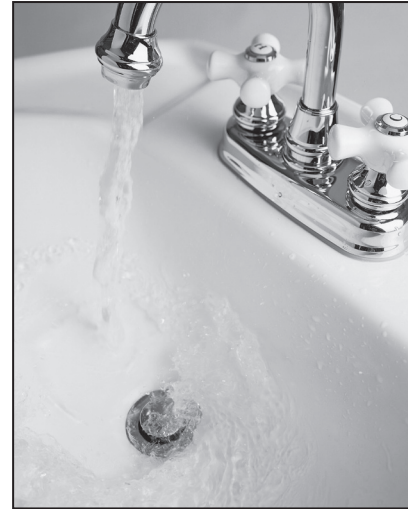
Stagnant water can pose a potential health risk. Flush water prior to reopening buildings that were closed during the COVID-19 pandemic.

Buildings that have been unused during the COVID-19 pandemic may contain stagnant water, which is a potential health risk. Buildings that have shut down or significantly reduced their water use have increased the risk of Legionella bacteria growth and the leaching of heavy metals from the building's plumbing system. Building operators should take steps to flush water from all hot and cold water fixtures to ensure water quality in their facility prior to resuming operations with employees or the public. To view the CDC water flushing guidelines for reopening buildings visit SantaBarbaraCA.gov/Water .