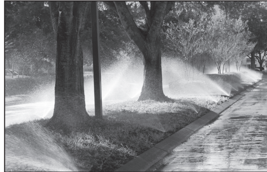
High pressure can cause misting, reducing the amount of water delivered to your plants.

Check and Reduce Your Water Pressure for Optimal Irrigation Efficiency