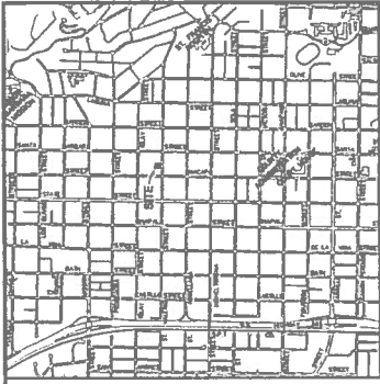
VICINITY MAP 7/25 SCALE