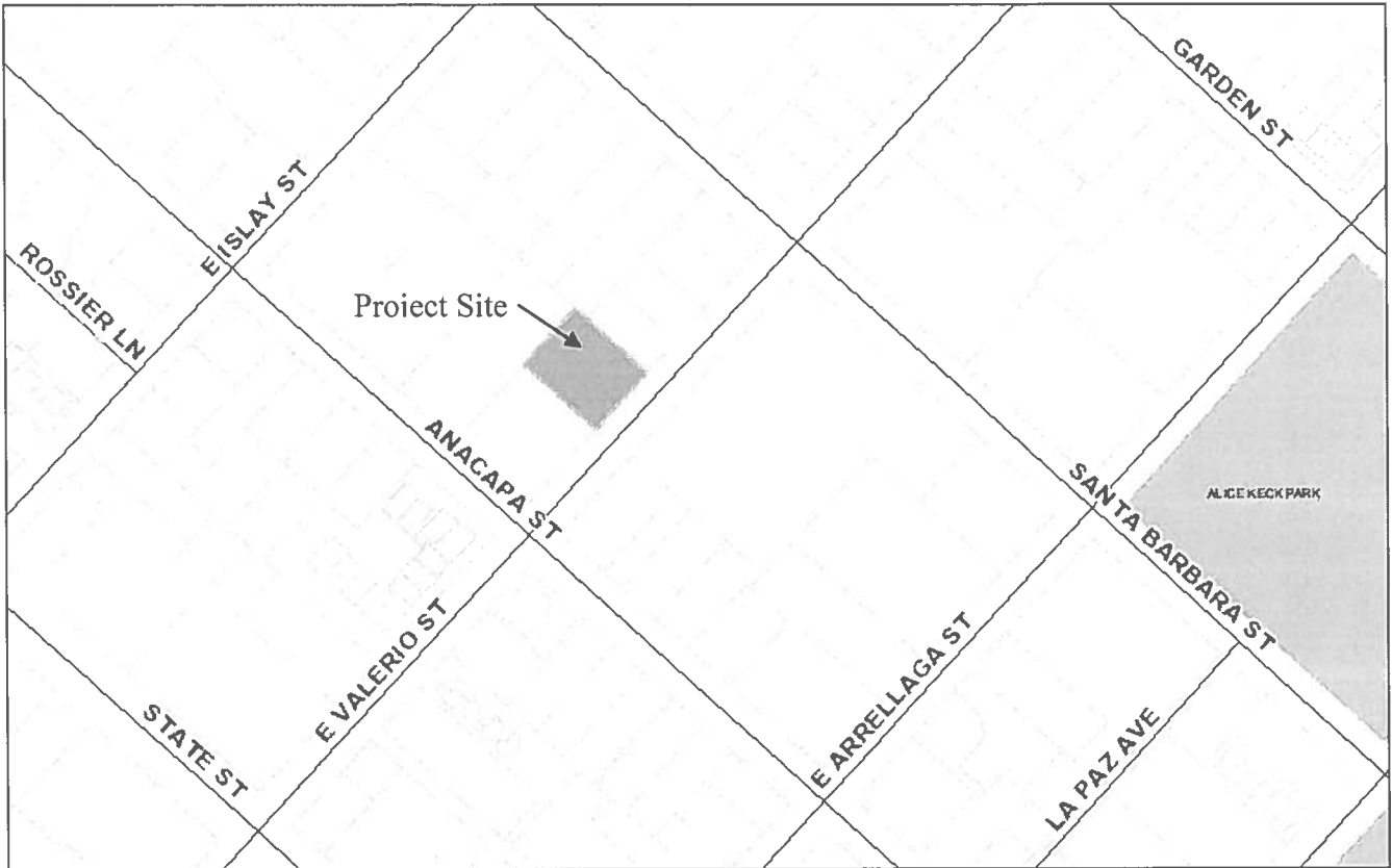
Vicinity Map – 115 & 117 E. Valerio St.