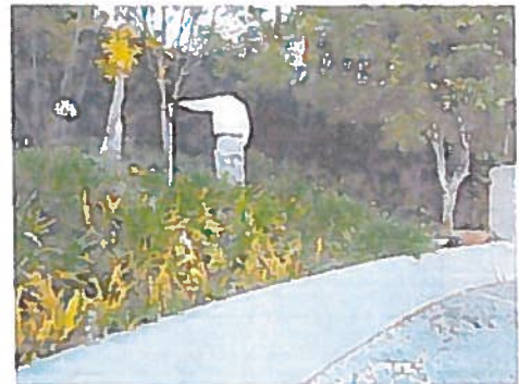
Stake shows 3 1/2' at 10' setback, virtually taking away our yard and privacy.