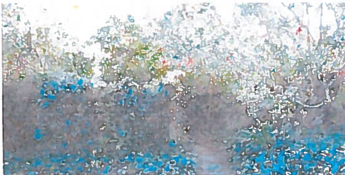
Current condition of our fence, both inside and outside the property line.