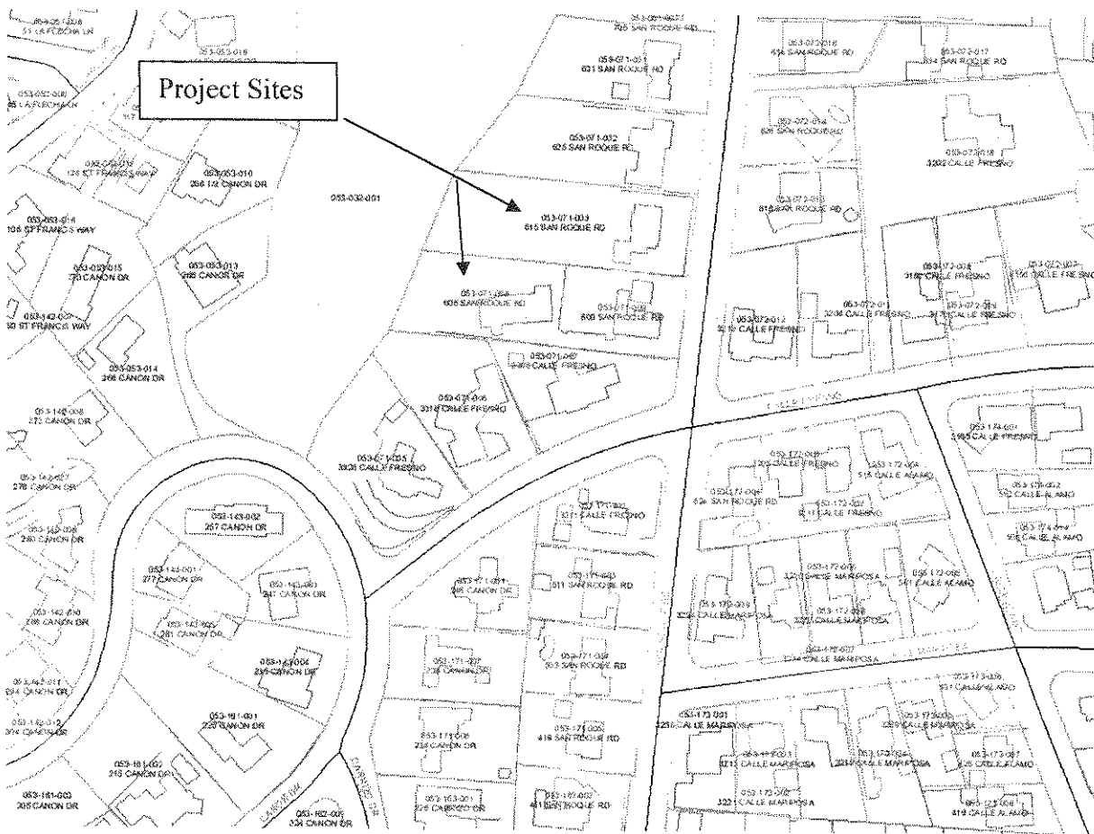
Vicinity Map for 605 & 615 San Roque Road

APPLICATION DEEMED COMPLETE: February 4, 2011 DATE ACTION REQUIRED PER MAP ACT: March 21, 2011