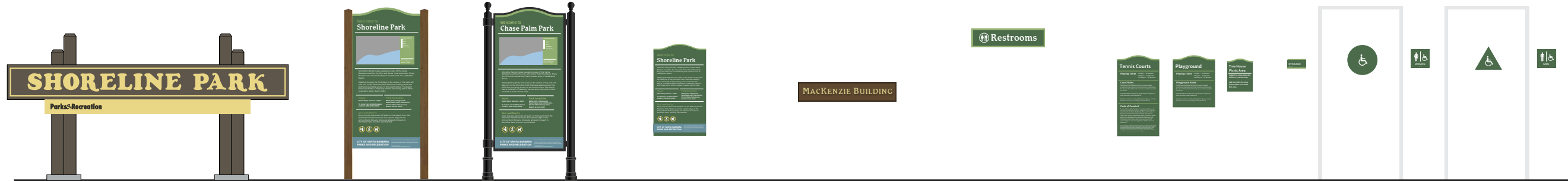
10 - Large Monument ID 11 - Small Monument ID