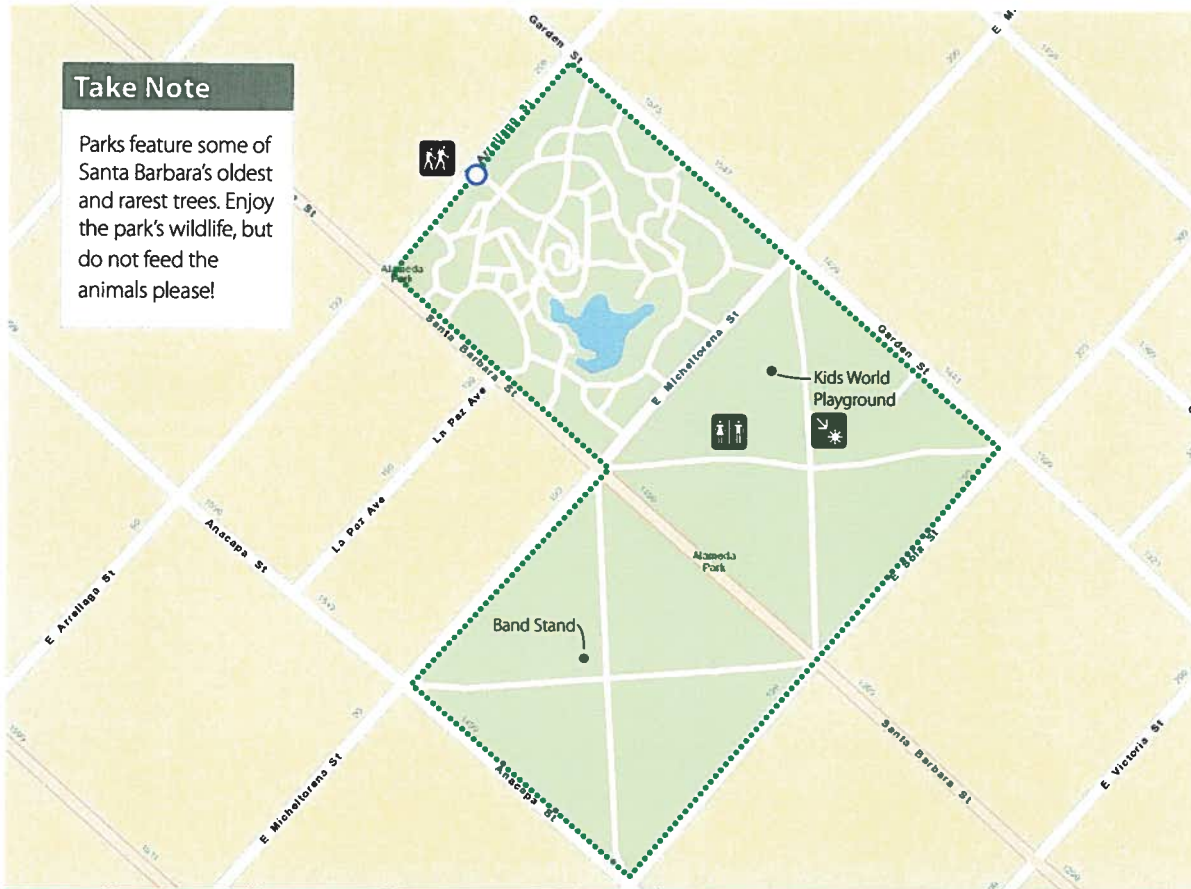
Alice Keck Park Memorial Gardens + Alameda Plazas Coordinates: 34.429741, -119.706707

Parks feature some of Santa Barbara's oldest and rarest trees. Enjoy the park's wildlife, but do not feed the animals please!