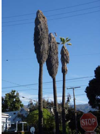
California Fan Palms