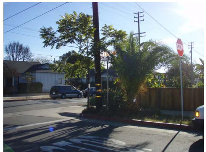
Ash sp. and Canary Palm