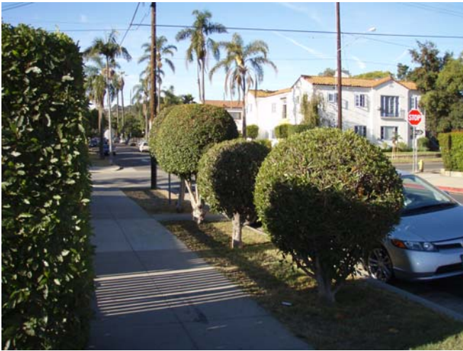
Shrubs on Anapamu St.