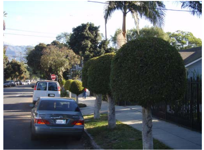
Shrubs on Ortega St.