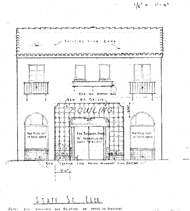
530 State Street, 1951 Drawings

The building is eligible for designation as a Structure of Merit under the following criteria provided by the Municipal Code, Section 22.22.040.