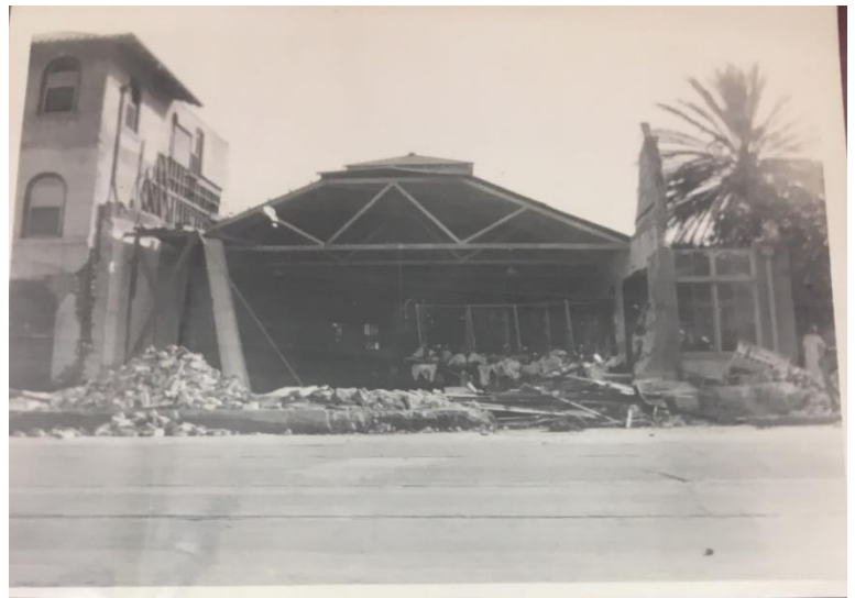
View of building after 1925 Earthquake.

The Historic Landmarks Commission added the building to the Potential Historic Resources List in 2014 based on the findings of the East Beach/Waterfront Survey that found the building eligible to be designated as a Structure of Merit. Originally constructed in 1909 as a one-story, concrete building for Enterprise Laundry. The owners replaced the building in 1921 with a one-story brick building. The June 29, 1925 earthquake damaged the building. The drawings for the repairs for the building dated August 21, 1925, illustrate the brick building sheathed in stucco. The building followed the new vision for Santa Barbara in its Spanish Colonial Revival features with three large, arched openings with true divided lights and a terra-cotta lined parapet facing State Street. The building remained Enterprise Laundry until 1974. In the 1970s survey, the front façade still had the stucco remaining, but a front-facing gable with terra-cotta tile coping replaced the Mission style parapet illustrated in the 1925 drawing, it is not known if the parapet was ever constructed as per the drawing, and the windows have less divided lights from those in the 1925 drawings. In 1977, Enterprise Fish Company renovated the building, removing the stucco from the brick façade. Sometime since 1977, the owners replaced the windows in the façade with four fixed divided lights.