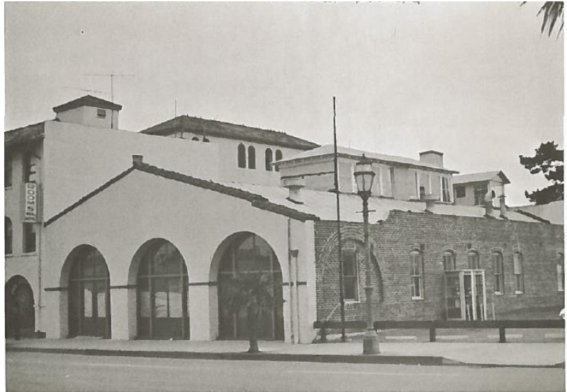
1977 Drawings of the building directing stucco removal from brick

Historic Integrity: The large openings on State Street remain, but the windows themselves are not original, nor do the existing windows match those in the 1977 drawings. The 1977 drawing illustrates the large opening on the north elevation facing the parking lot as enclosed with brick and a double-hung window as existing. The façade has also been stripped of the stucco façade of the 1925 building. Designed as a brick building with a stucco façade lined with terra-cotta coping in 1925. The 1977 renovation stripped the façade to expose the building as a vernacular commercial brick building. At the alteration to the brick façade may be a change that has acquired its own significance, the building can convey its 1977 appearance as a vernacular brick commercial building, but it does not convey its 1925 appearance.