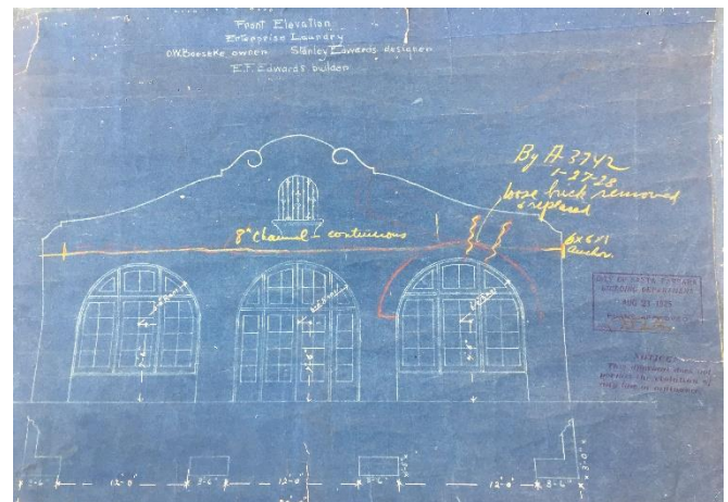
225 State Street original drawings dated August 21, 1925

The urban historian prepared this evaluation to assist the Historic Landmarks Commission in the review of