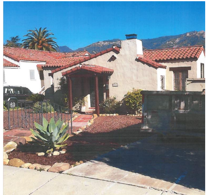
Photograph of house prior to work without permits in 2017.

The applicant removed the exterior stucco and chimney prior to receiving required permits for exterior alterations. Work was stopped by enforcement staff until the project completes design review and receives a building permit from the Building and Safety Division. In order to resolve the enforcement case and protect the house from further deterioration by exposure to the elements, the owner agreed to restore the original front elevation and side elevations most visible to the public to their original configuration. As the scope of work entails a restoration to the original condition, the project required HLC Consent review with the Commission Historian, Commissioner Grumbine, and Commissioner Mahan. Upon completion of the project, the Commission will review the property to consider designation as a Structure of Merit or removal of the property from the Potential Historic Resources List.