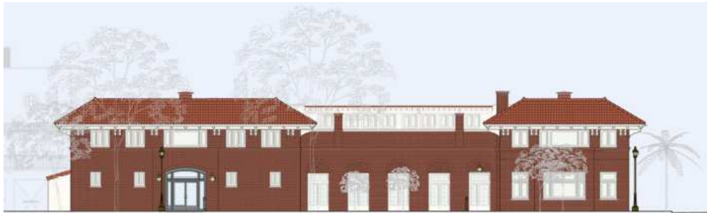
PROPOSED NEW ELEVATION (VIEW FROM CARRILLO STREET)

Architectural renderings of rehabilitation: