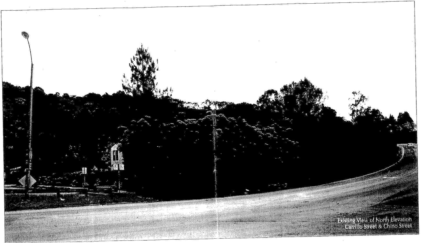
Existing View of North Elevation Carrillo Street & Chino Street