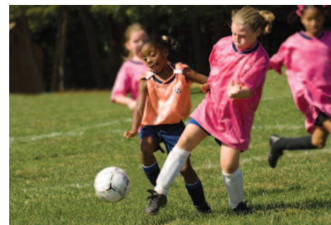
Many communities use recycled water to irrigate parks and playgrounds.

Through nature’s cycles, all water on Earth is recycled water. But, typically, when we hear the term “recycled water” it means wastewater that is sent from our home or business through a pipeline system to a treatment facility where it is treated to a level consistent with its intended use or disposal method. It is then routed directly to a recycled water system for uses such as irrigation or industrial cooling.