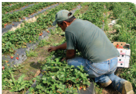
An agricultural worker in a field irrigated with recycled water.

Among the perceived risks is concern about the presence of trace concentrations of Pharmaceuticals and Personal Care Products (PPCPs) found in recycled water. But findings from a recent study indicate that, depending on the chemical and the exposure situation, it could take anywhere from a few years to many millions of years of exposure to non-potable recycled water to reach the same exposure to PPCPs that we get in a single day through routine activities.